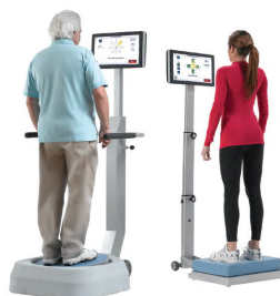
Balance System™ BioSway™