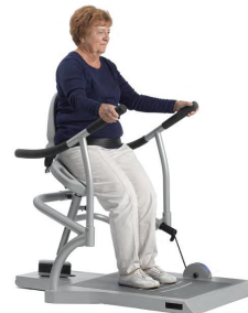
Sit2Stand™ Squat Assist-Trainer