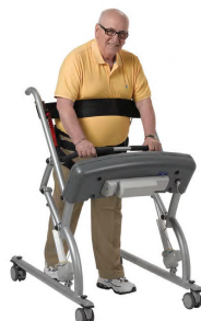
Mobility™ Assist Device