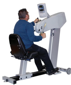
Upper Body Cycle