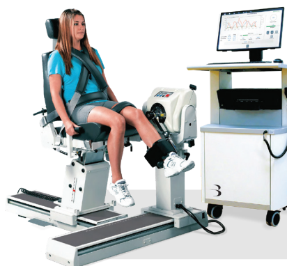
System 4 Dynamometer