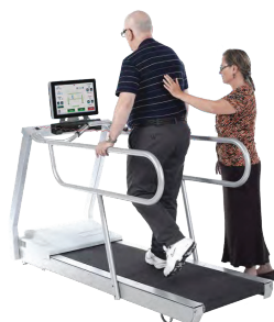
Gait Trainer™ 3