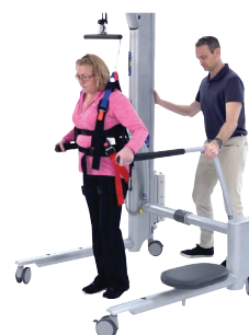
NxStep™ Unweighing System