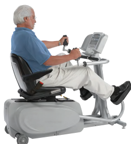
BioStep™ 2 Elliptical Ergometer