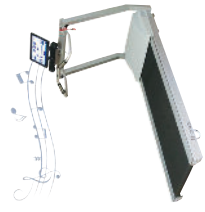
GoIt Trainer™ 3