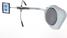
Balance System™ SD

Be the Provider of Choice for this growing population... with Biodesx. 1-800-224-6339 | Int'l: +1-631-924-9000 | info@biodesx.com