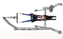
NoStep™ Unweighing System