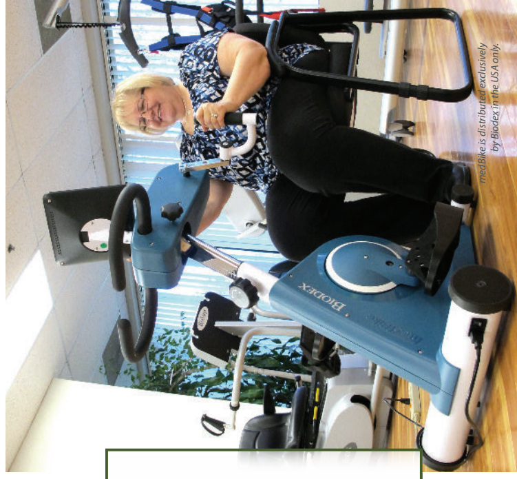
medBike is distributed exclusively by Biodesx in the USA only